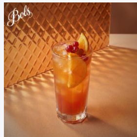
Sex on the Beach

Bols Vodka · Bols Peach · OJ · Grenadine